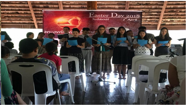
Wiang Baptist Church youths & adults singing on Easter Sunday