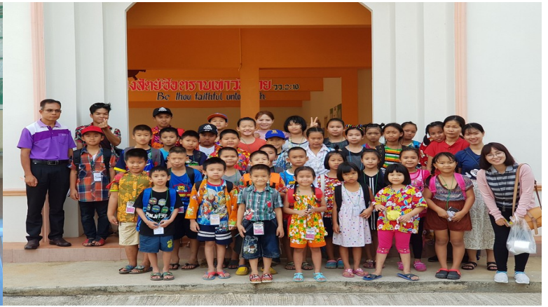
Summer Camp at Lanna Baptist Church