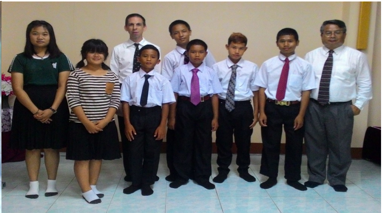
Samuel's House Bible School Students