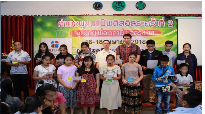
Annual Thai Independent Baptist Churches Youth Camp & our group singing at the camp.