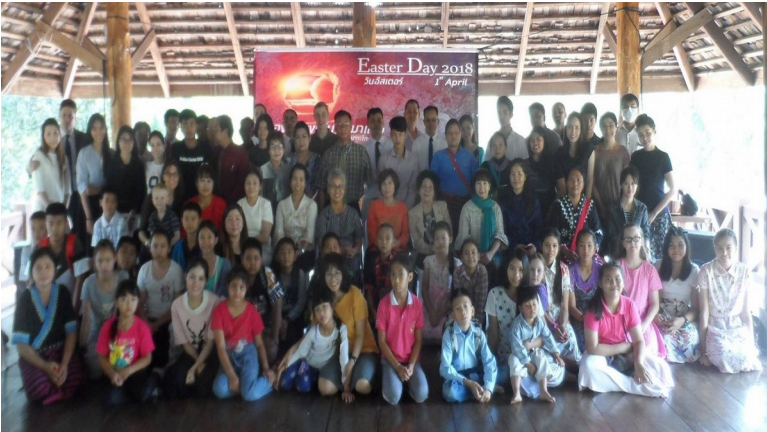
Easter Group Picture